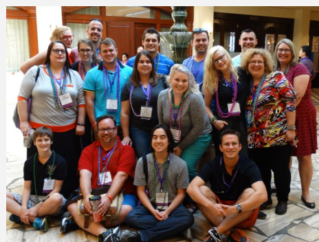
Oklahoma State University is well represented at the ALGBTIC Inaugural Conference.