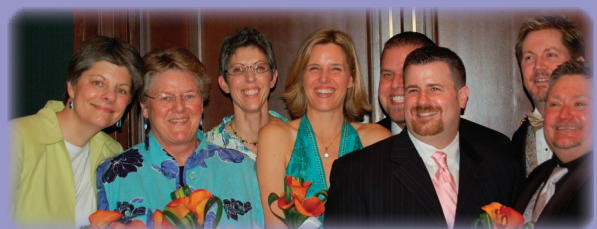
The happy newly-weds.