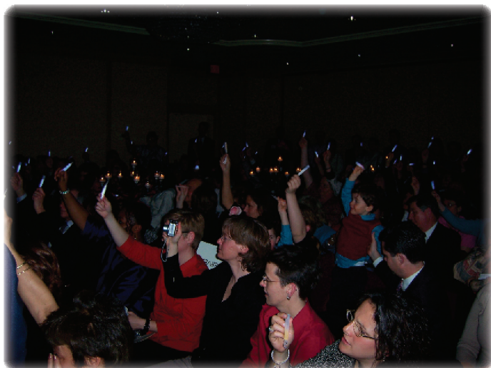
AGLBIC Montreal Wedding attendees lighting the way during the ceremony on April 1, 2006.